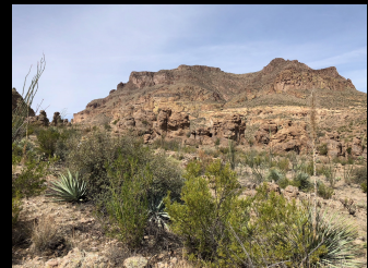
Wood Canyon / Telegraph Canyon ridgeline