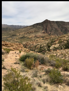
Wood Canyon / Telegraph Canyon Ridgeline