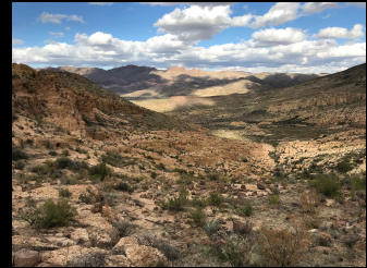
View from Upper (southern) Wood Canyon looking north